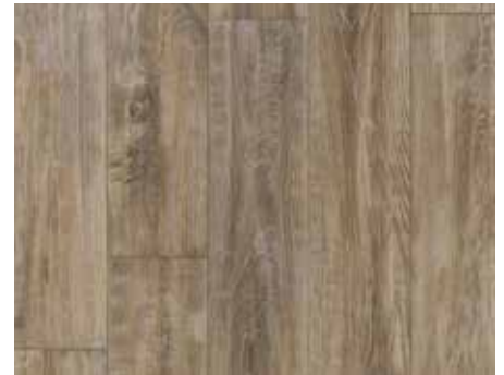
MORRISVILLE OAK 44301