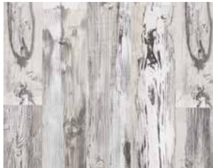
PACIFIC BEACH 44307