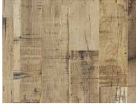
SANTA FE 44297