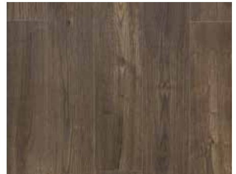
ABBERVILLE HICKORY 44306