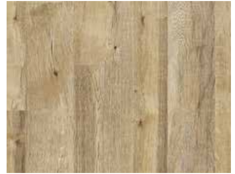
MAJESTIC OAK 44311