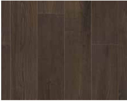
WAKEFIELD HICKORY 44305