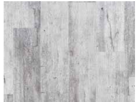
ANTIQUE WINTER 46098