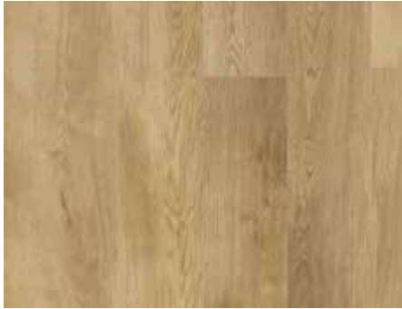
MICHIGAN OAK 44310