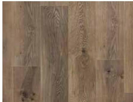
PEMBERTON OAK 44304