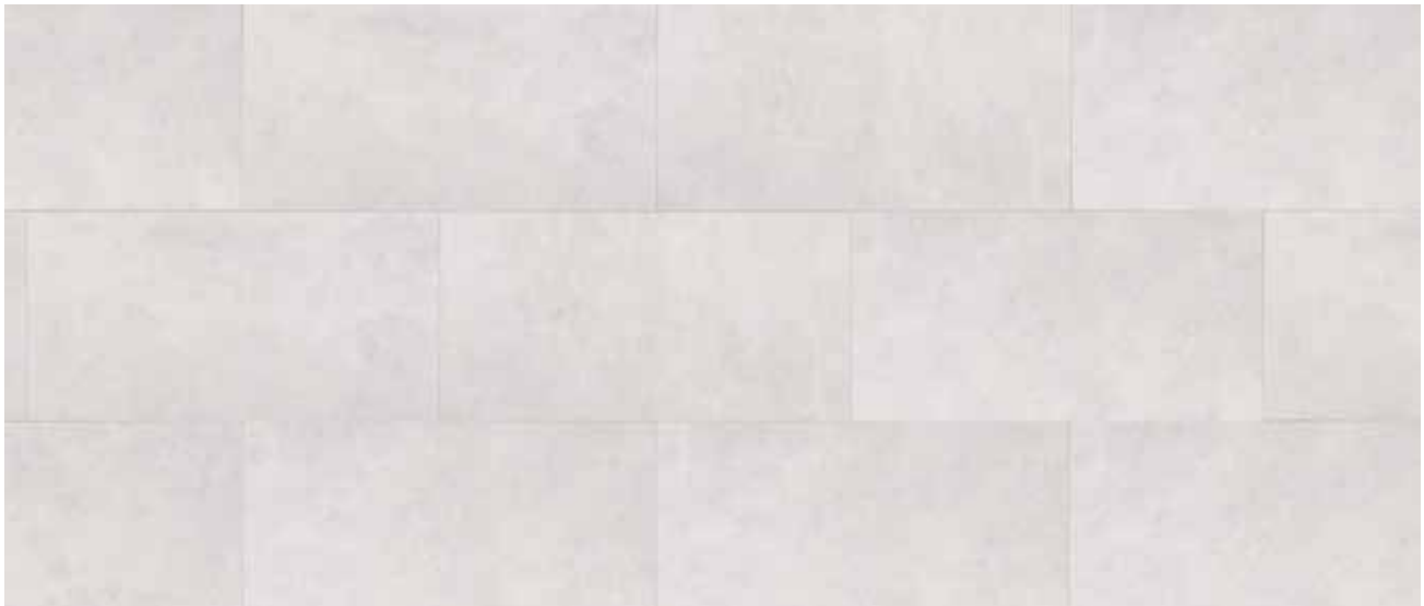
WHITESTREAM STONE 46163