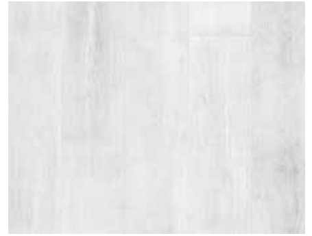
VANITY WHITE 46097