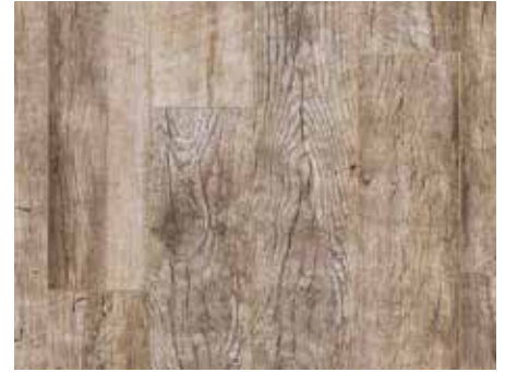
OLD WESTERN 46099