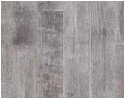
DARK TRAIL 46096