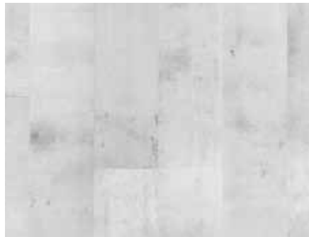
OPAL WOOD 46100