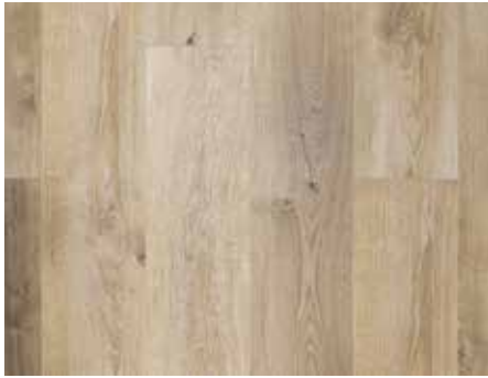
VELVET SUMMER 46095