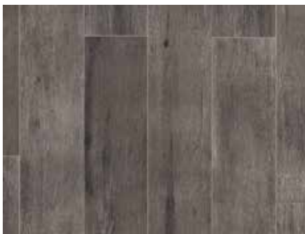
LEWISBURG OAK 44312