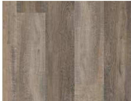
SEA WASHED OAK 44296