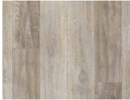
ACADIA OAK 44300