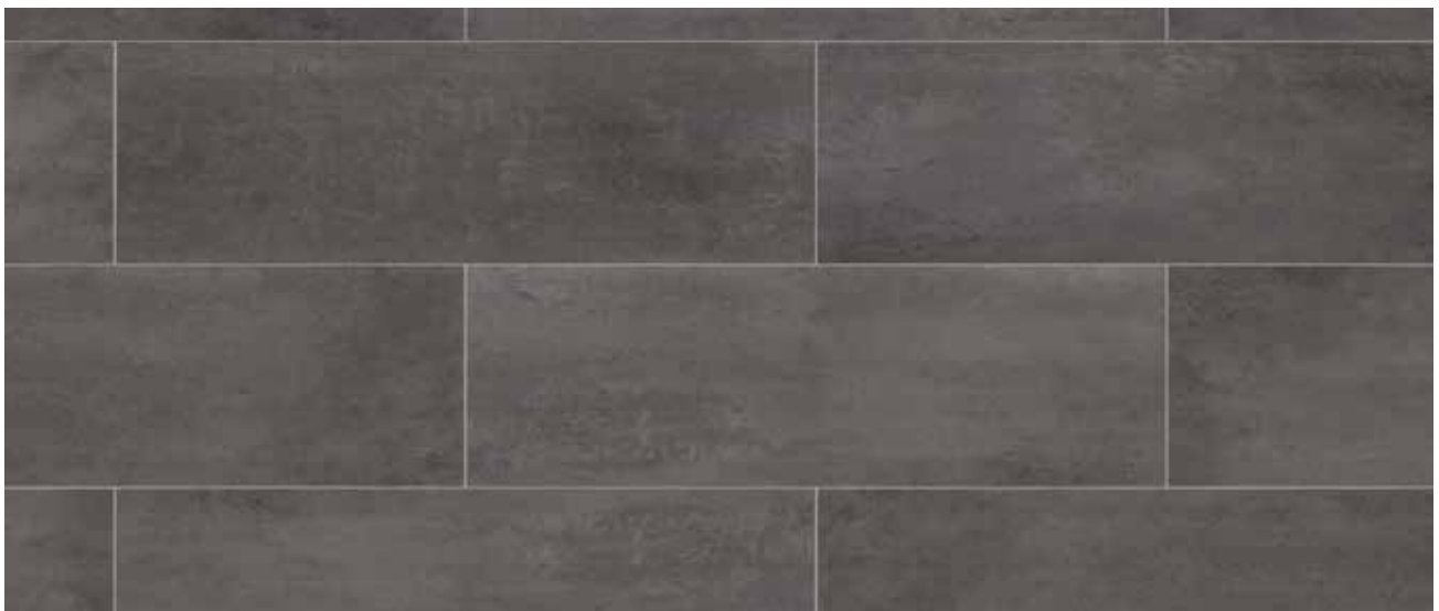
SHADOW CASTLE 46195