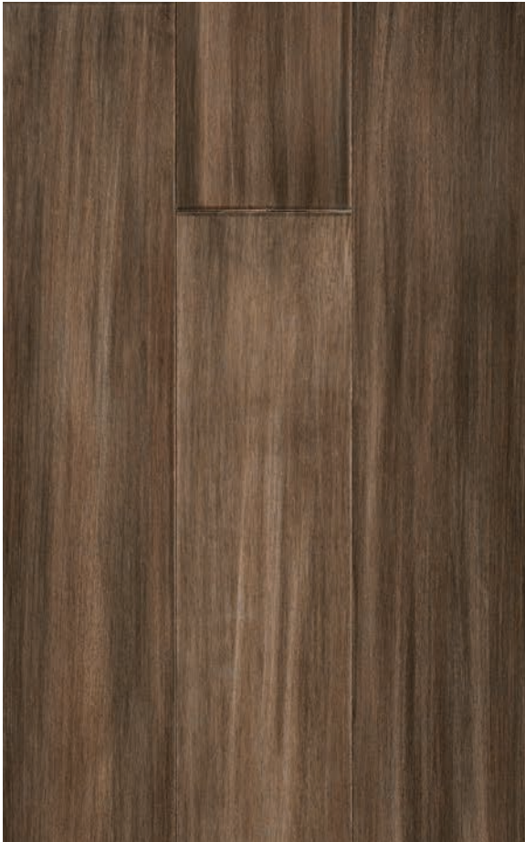
7102 DENALI BAMBOO