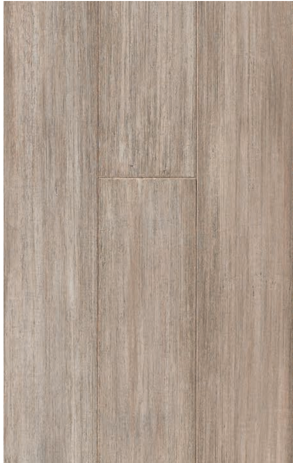
7104 KILIMANJARO BAMBOO