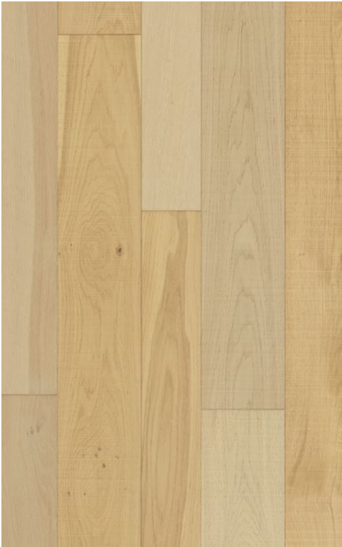
7122 INCEPTION OAK