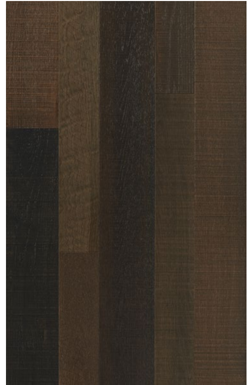
7124 SPECTRE OAK