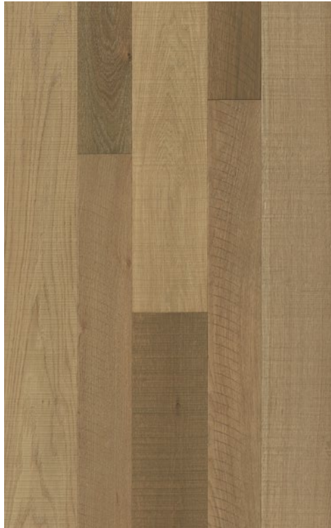
7123 REVERIE OAK