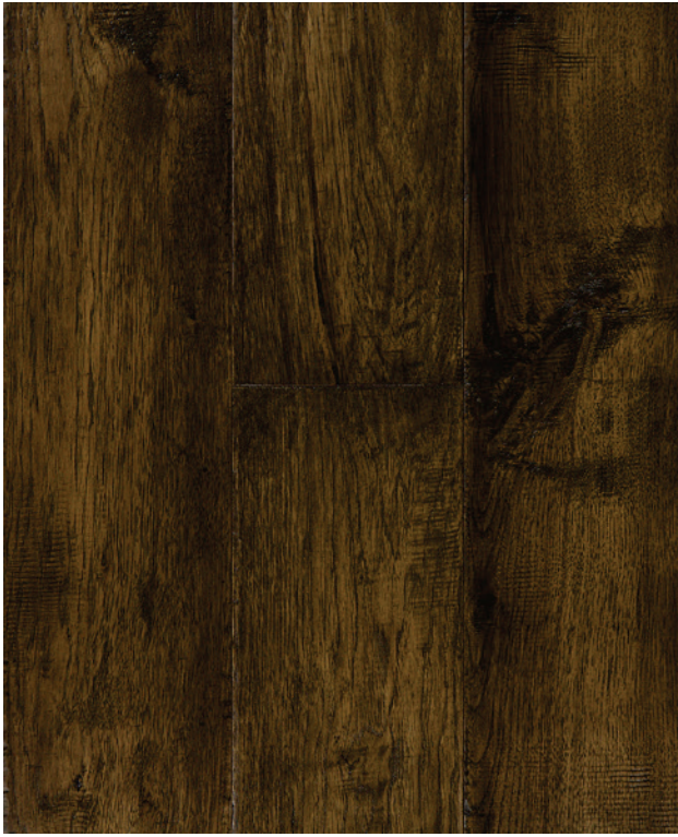
7001 FRONTIER HICKORY