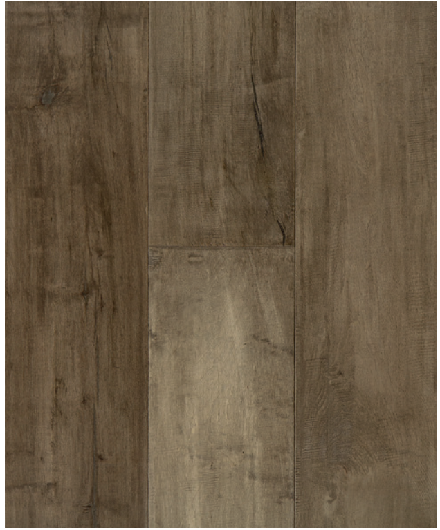
7004 DRIFTWOOD MAPLE