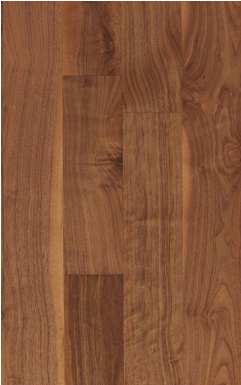
7088 IMPERIAL WALNUT