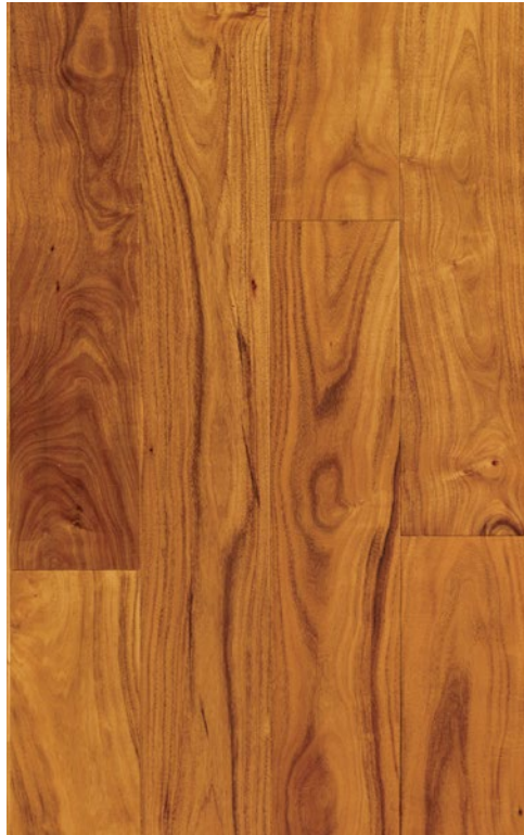
7089 NATURAL ACACIA