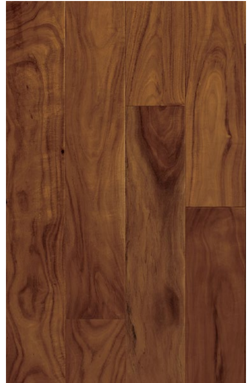
7090 CINNAMON ACACIA