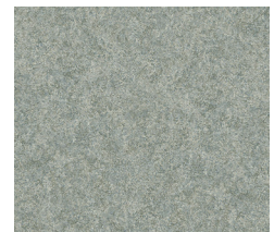
Techno D028V | 972