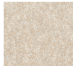
Techno D028V | 932