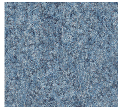
Techno D028V | 977