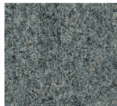
Techno D028V | 998