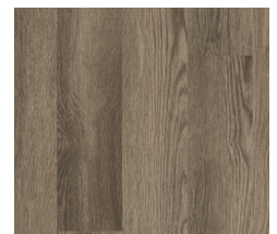
Dark Mire D554V | CO794