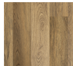
Lakeshore Trim D554V | CO757