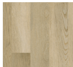
Weathered Drift D554V | CO750