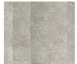
Slate Touch D554V | RE993