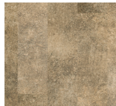
Burl Mirage D554V | RE942