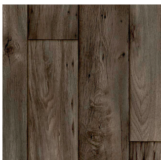
Riche | 545 U2720.212K545G144