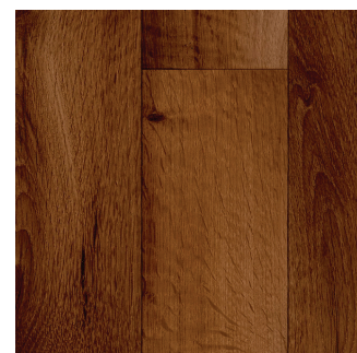
Biscay | 538 U3680.212K538G144