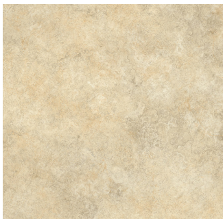
Cezanne | 531 U8203.212K531G144