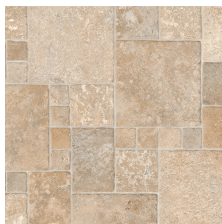
Toucan | 536 U4290.212K536G144