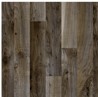
Baron | 713 U6580.212K713G144