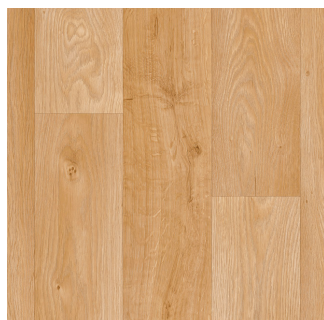
Aspin | 551 U3890.212K551G144