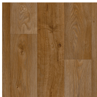
Aspin | 583 U3890.212K583G144