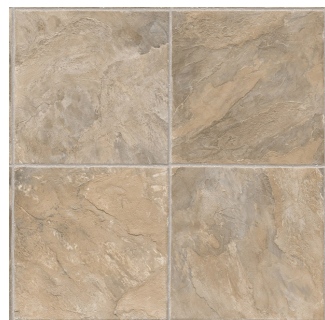
Condor | 564 U3140.212K564G144