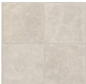
Andorra | 591 U3170.212K591G144