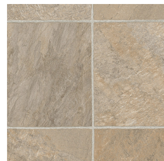
Sandridge Slate | 594 U5330.212K594G144