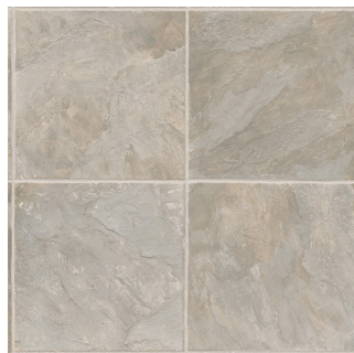
Condor | 573 U3140.212K573G144