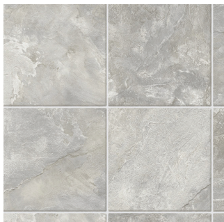
Chasen | 932 U6920.212K932G144