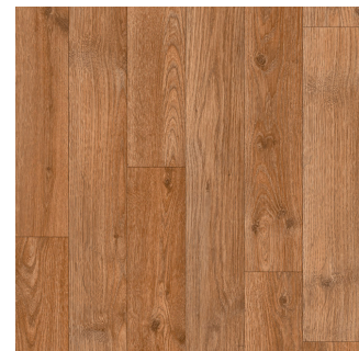
Nice | 563 U1070.212K563G144