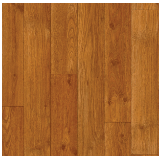
Nice | 564 U1070.212K564G144