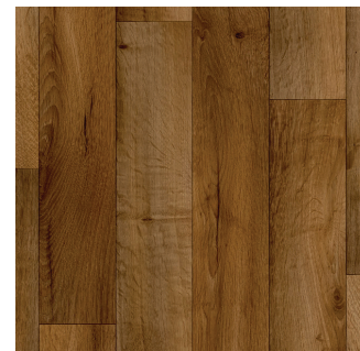
Burlington | 565 U3680.212K565G144