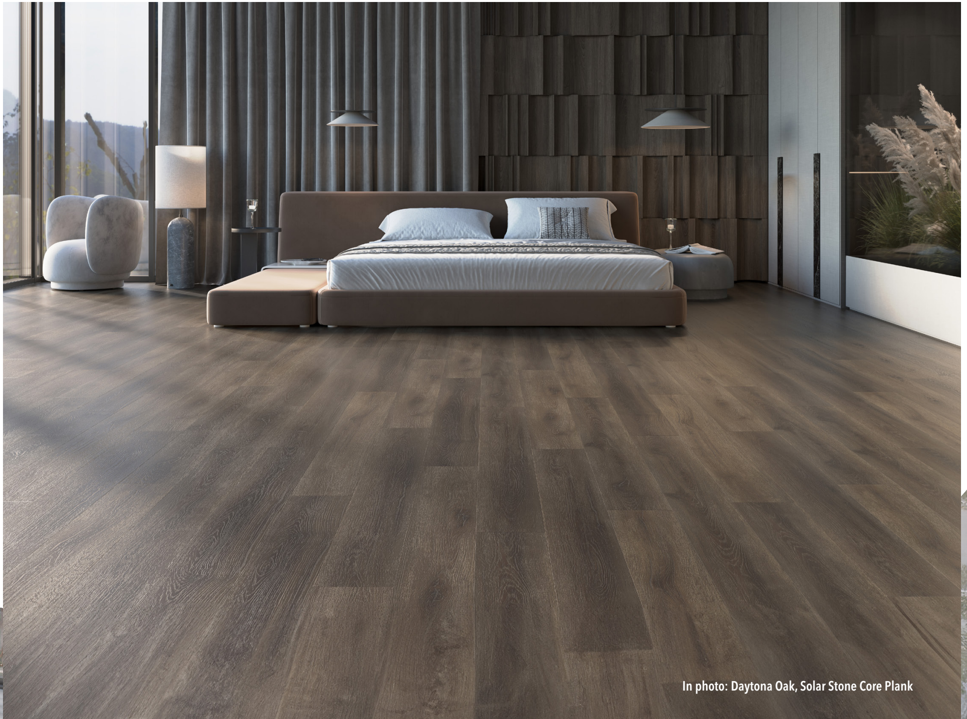
In photo: Daytona Oak, Solar Stone Core Plank