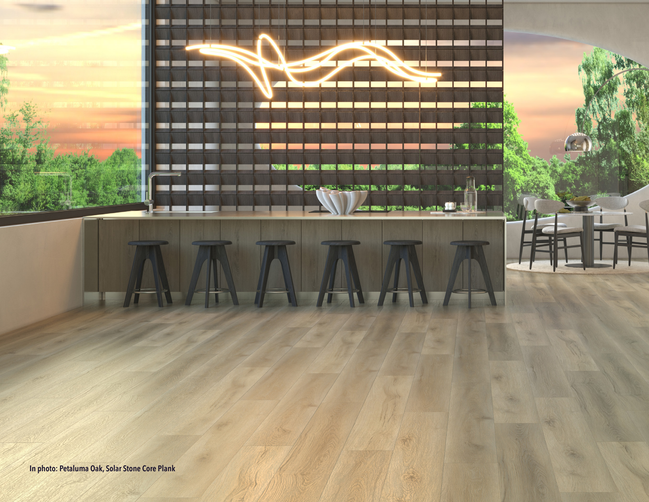
In photo: Petaluma Oak, Solar Stone Core Plank