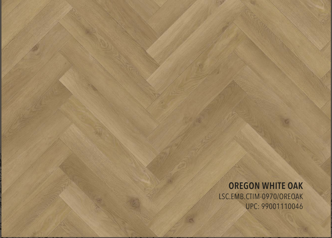
OREGON WHITE OAK LSC.EMB.CTIM-0970/OREOAK UPC: 99001110046

Available in two distinct styles to realize your vision