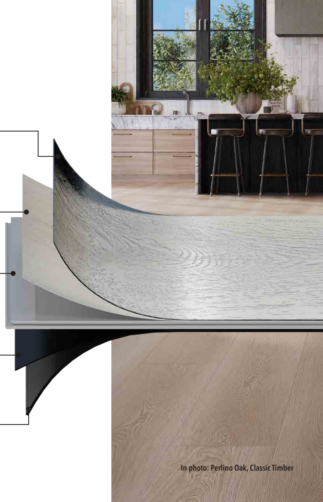
In photo: Perlino Oak, Classic Timber