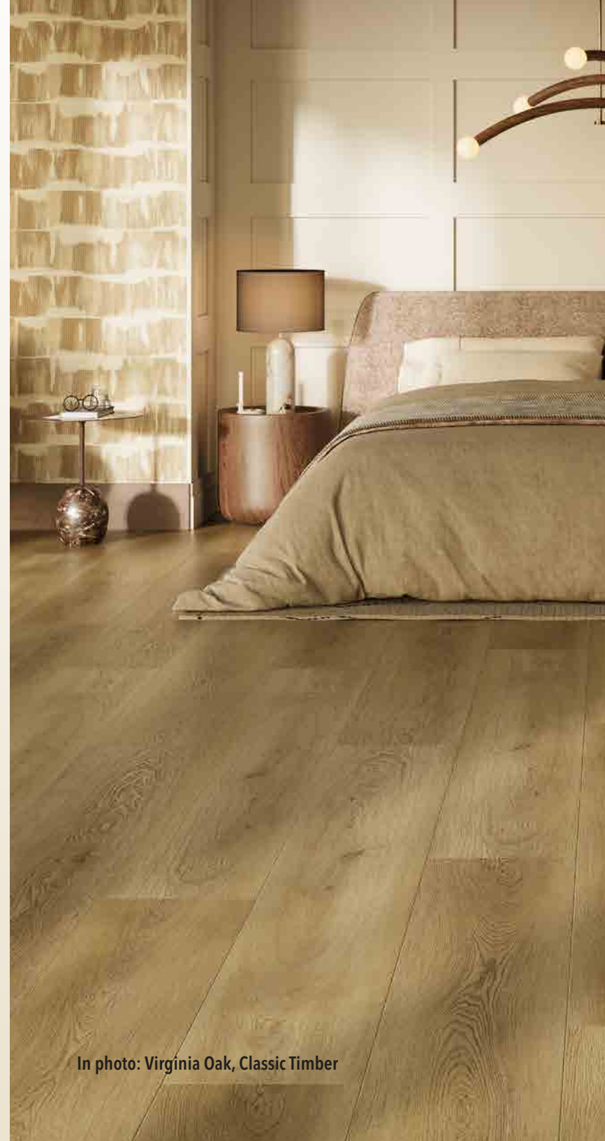
In photo: Virginia Oak, Classic Timber

Intelligently designed and manufactured to provide a robust and low maintenance flooring system for both residential and commercial applications.