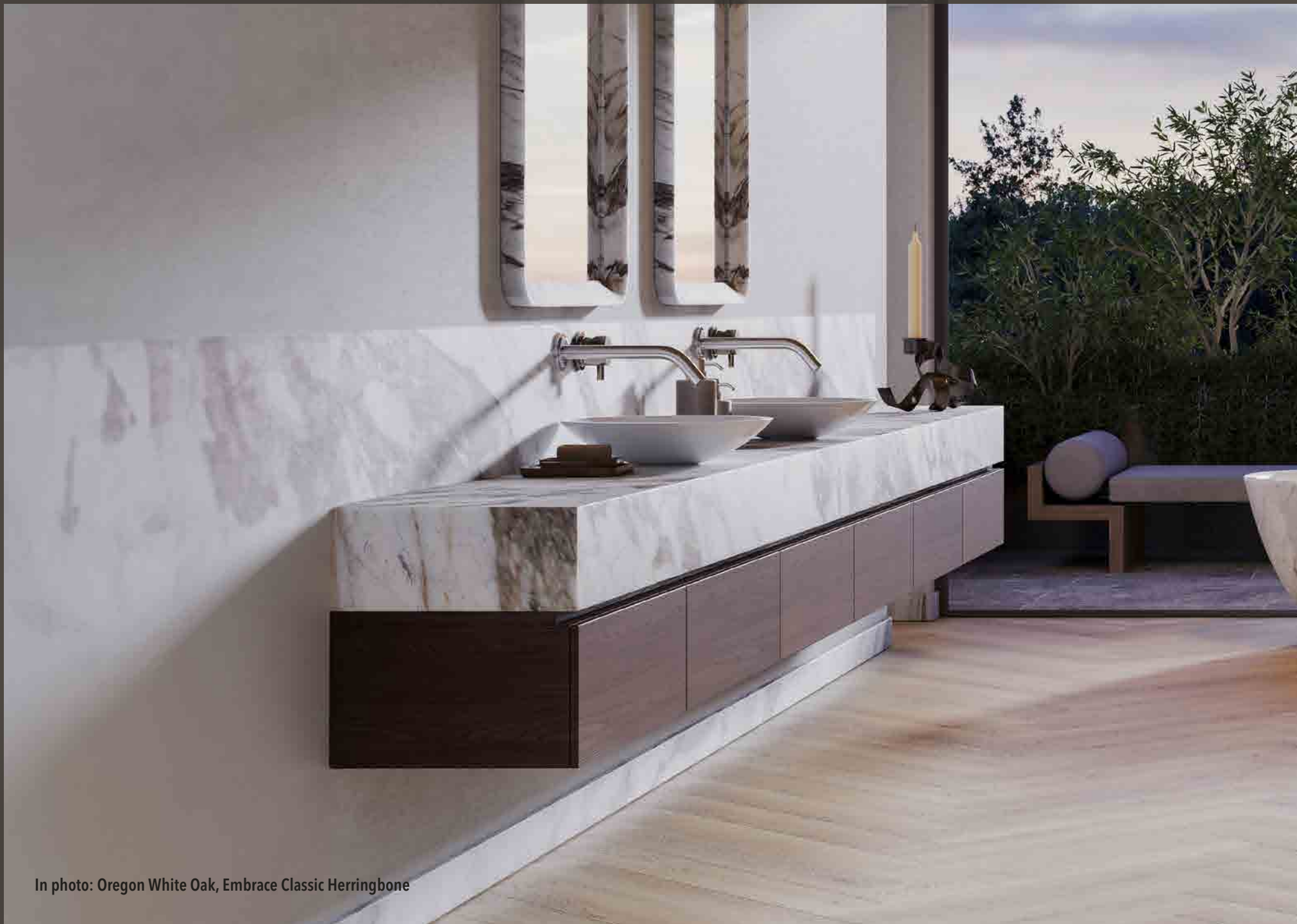
In photo: Oregon White Oak, Embrace Classic Herringbone