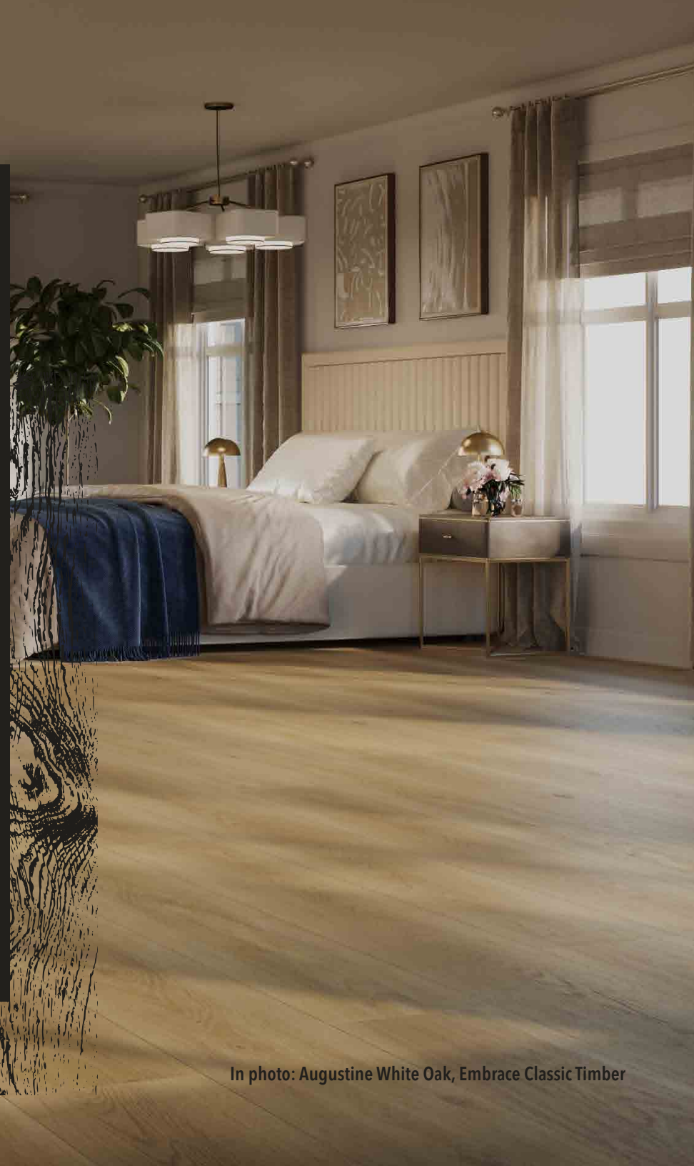
In photo: Augustine White Oak, Embrace Classic Timber