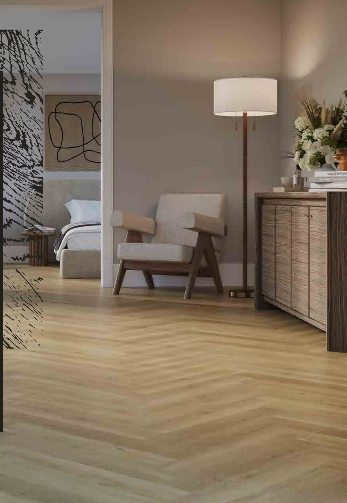
In photo: Augustine White Oak, Embrace Classic Herringbone